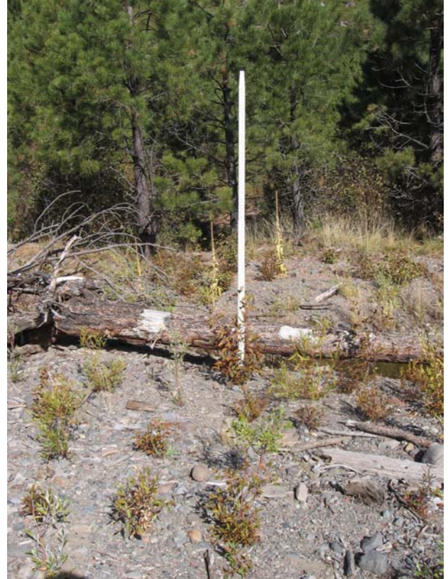
Photograph 3. Phase III Plants