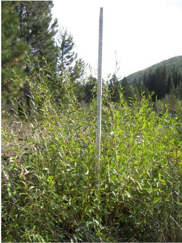
Photograph 2. Phase I Plants